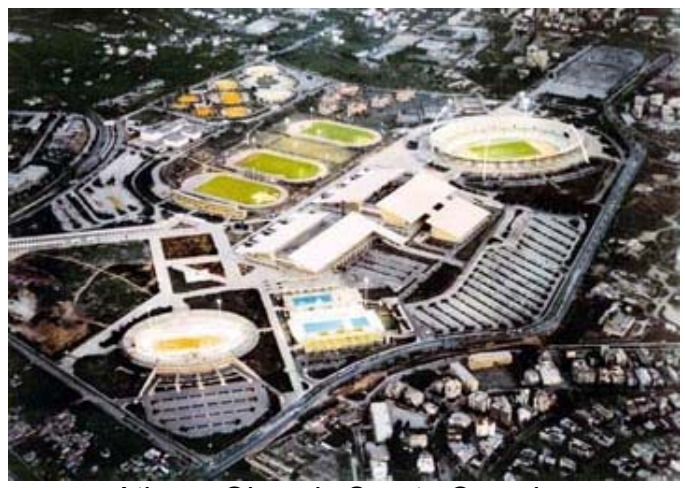
Athens Olympic Sports Complex

Among the items listed in the agenda of the upcoming 38th CISS Congress is determining which two cities, Athens in Greece GRE or Taipei in Taiwan TPE will succeed in the bid to host the 21st Deaflympic Summer Games in 2009.